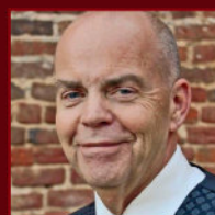
Jack Sullivan Emergency Responder Safety Institute